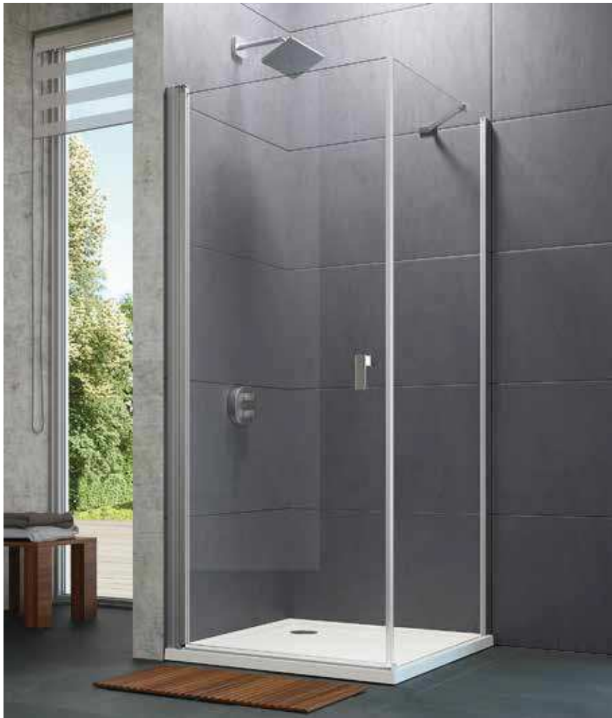
Swing door with side panel