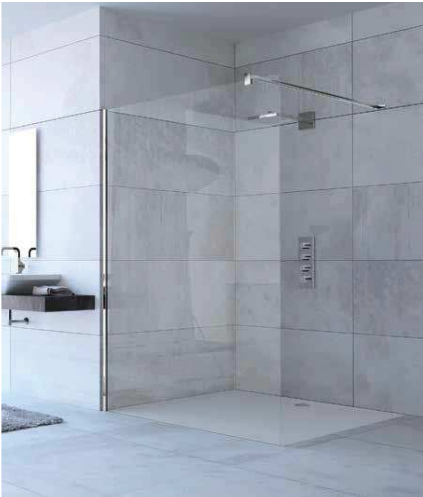
Walk-In side panel, free standing