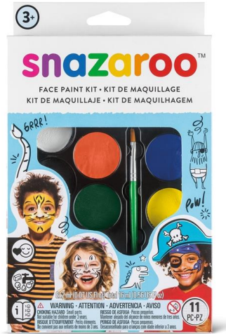
Object of the declaration.