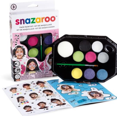
Object of the declaration.