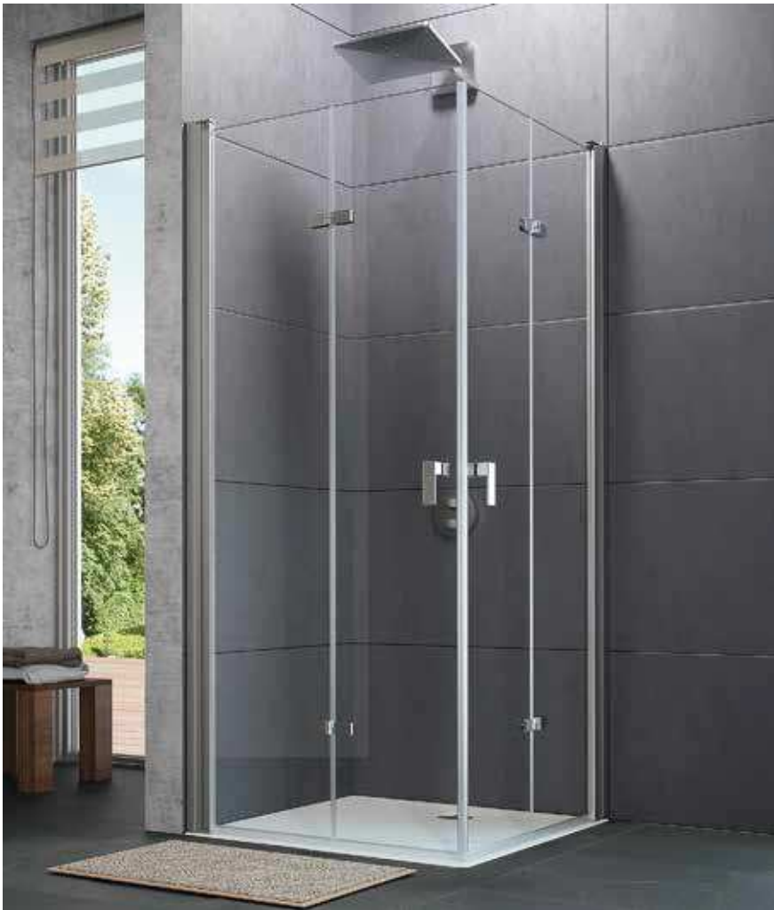
Folding swing door, corner entry